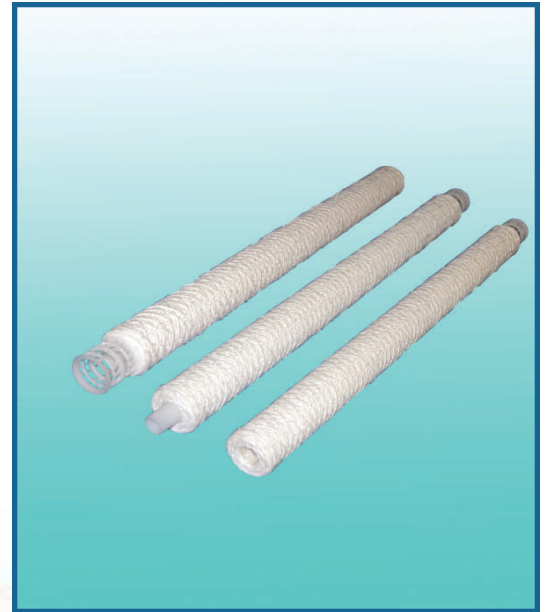
JJ Series Filter Cartridges

Jonell has become a world leader in the filter cartridge market with the JJ Series wound cartridge. We precisely pattern fibers to create consistently reliable filtration with a trapping effectiveness of up to 99%. Jonell wound cartridges offer a gradual pressure increase during cartridge life instead of the abrupt flow cutoff often experienced with improperly designed cartridges. JJ cartridges use a unique filtration design to maximize particle retention and service life in fluid filtration applications. JJ cartridges are available in eight standard removal ratings of 2 \mu m, 5 \mu m, 10 \mu m, 25 \mu m, 50 \mu m, 75 \mu m, and 100 \mu m pore sizes to meet a wide range of performance requirements.