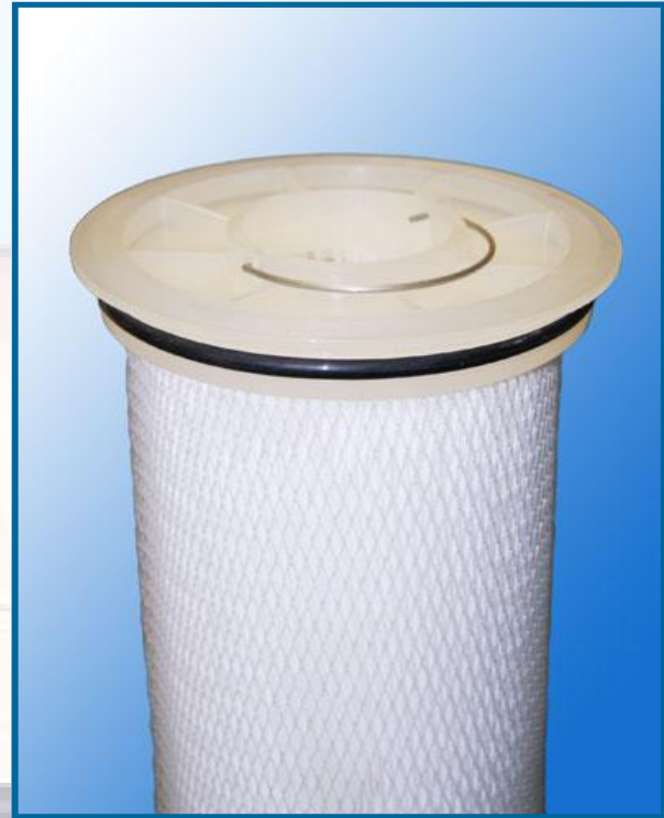
JXC series pleated filter bag replacements

The JX C Series is a pleated style technology supported with robust end caps. The filtering media is then attached to the end caps and core via thermal bond to prevent any possibility of by-pass at media sealing points.